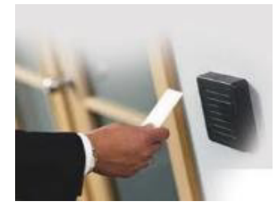
Access Card System