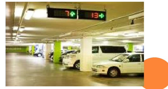
Ample Car Park