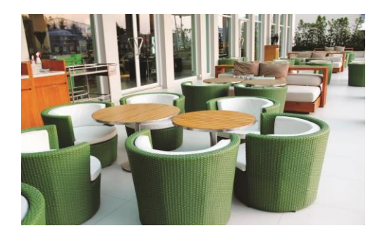
Spacious Corridor *Pillar Free Design