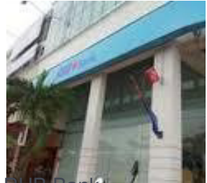
Hong Leong Bank